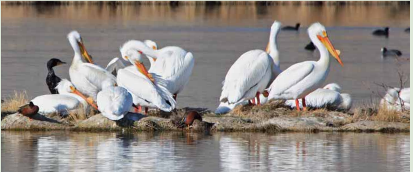
American white pelicans and other migratory birds rely on the watery habitats of Fish Springs National Wildlife Refuge—the only wetlands for 50 miles.

To comprehend the magnitude of the threat posed by Las Vegas' plan to pump rural Nevada water, it is helpful to understand the natural processes that formed and continue to sustain life in the Great Basin.