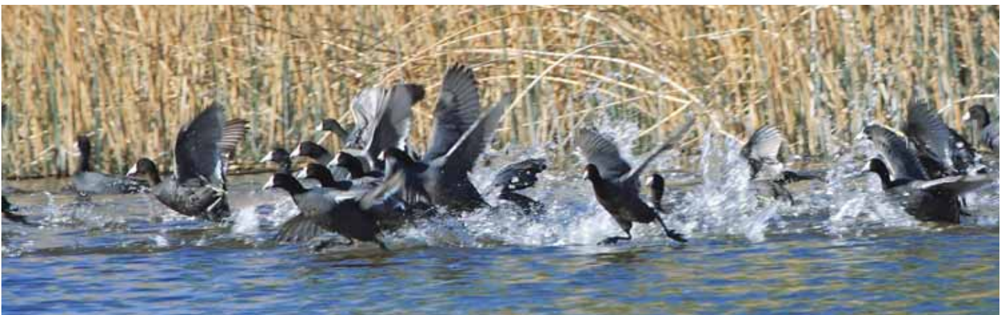
American coots scramble across the surface of a Pahranaagat refuge pond for takeoff.

Long ago, Paiute Indians named this stretch of land "Pahranaagat," place of many waters. Today, this oasis is part of the Pahranaagat National Wildlife Refuge, established in 1963 to protect an essential stopover for waterfowl and songbirds along the Pacific Flyway. It also provides habitat for many species of special concern and endangered and threatened species such as the desert tortoise, bald eagle and southwestern willow-flycatcher, a six-inch-long bird