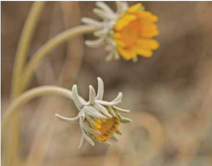
The Ash Meadows sunray is one of several imperiled plants found in an area where the pipeline could lower the water table 50 to 100 feet.

protects a unique habitat of isolated species, a Galapagos-like island of water in a sea of Mojave Desert, a place with more endemic species than any other area in the country and the second-highest number in North America. 23 In addition, this system of springs and streams and pools provides habitat for more than 240 species of birds including roadrunners, quail, phoebes and thrashers, many reptiles and mammals such as coyotes, jackrabbits and sometimes desert bighorn. The refuge draws 50,000 visitors annually, many of whom travel great distances to see its incredible diversity of plants and animals.