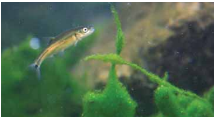
The endangered Moapa dace breeds primarily in the warm springs of the Moapa Valley refuge.

About 1,200 Moapa dace now exist, breeding almost exclusively at this refuge, which springs from the aquifer that Las Vegas and its satellite communities are planning to tap. Just 20 miles down the road from the refuge, a developer wants to build a 42,000-acre golf course community with up to 12 golf courses, a swimming complex and 150,000 new homes, all on top of critical habitat for the threatened desert tortoise. If this development and the SNWA pipeline succeed in pumping thousands of acre-feet of groundwater