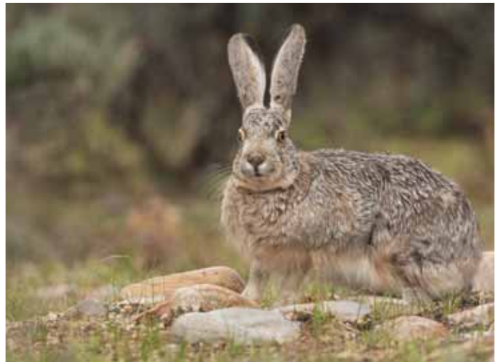
The jackrabbit is a desert animal that, like many others, gets most of the water it needs from the plants it eats.

The bright wind-swept valleys, dark caverns, spring-fed streams and high peaks of Great Basin National Park protect a land of the ancients. Bristlecone pine, including some of the world's oldest