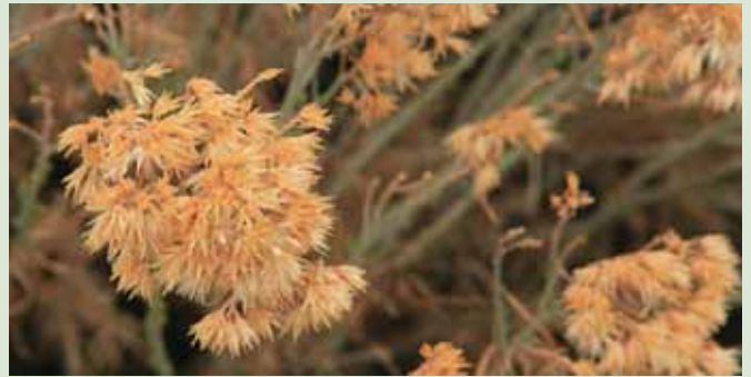
Rabbitbrush is one of the long-rooted, groundwater-dependent plants known as phreatophytes that keep arid soils in place.

D esert plants, particularly the desert shrub community of greasewood, rabbitbrush and sagebrush—plants collectively known as phreatophytes —are some of the most underappreciated plants around. Their role in keeping the air clean and healthy, in coloring the desert floor, providing shelter and shade for animals and perfuming the air is misunderstood or, even worse, ignored. So much so that the hydrologic approach to groundwater management in Nevada calculates the amount of water that can be withdrawn from an aquifer by assuming that if groundwater-dependent plants die—and therefore are no longer releasing water to the air through evapotranspiration—more water will be available for people to use. The problem with this approach is that along with being a foundational element supporting biodiversity in the desert (providing shelter, shade and food for desert animals), these plants—with roots that can reach nearly 50 feet into the ground—anchor the dusty desert soil, keeping it in place when the winds kick up. One study determined that the pipeline plan could cause the loss of more than 60 percent of the phreatophytes in some areas of the Great Basin. 19