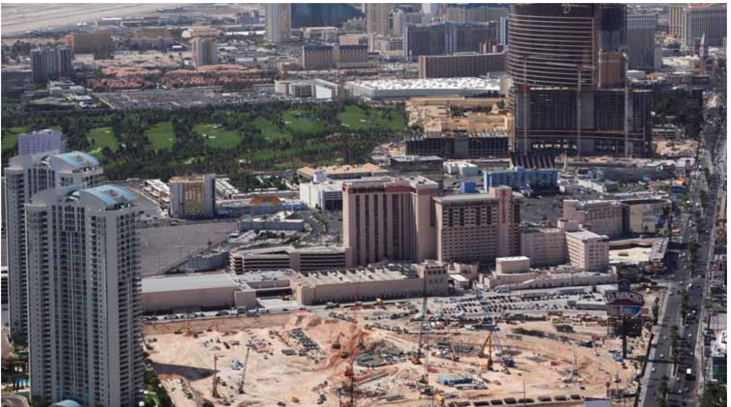
Las Vegas is the fastest-growing metropolitan area in the United States.

And while even misallocated and mismanaged Colorado River water was more than enough for Las Vegas in its infancy—the city had only a few thousand people living in it prior to World War II—the state's encouragement of rapid-fire population growth has stretched the Colorado thin. From 1950 to 2005, Clark County's population grew from 48,000 to an estimated 1.75 million people. 5 This incredible growth has been driven largely by Las Vegas, the fastest-growing metropolitan area in the country, according to the last census. 6 The population nearly doubled in the decade prior to 2000, growing from 850,000 to more than 1.5 million people, and is expected to double again by 2030. Moreover, not only is the city growing, it also continues to have one of the highest per capita rates of water consumption in the West, multiplying its draw on the Colorado River. 7 In addition to its suburbs, the city is supporting the development of satellite communities, small cities farther out in the desert, which put even more pressure on scarce water resources.